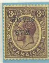
3d Purple/yellow overprint inverted