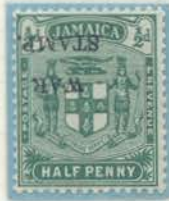
1/2d Blue-green overprint inverted