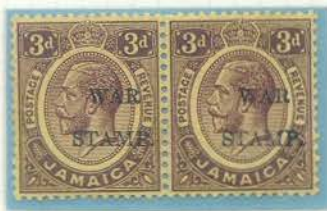
3d Purple/yellow stop inserted and "P" impressed a second time