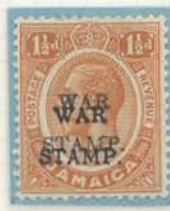
1 1/2d Orange overprint double