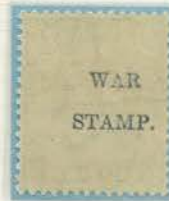
1/2d Blue-green overprint on the back only