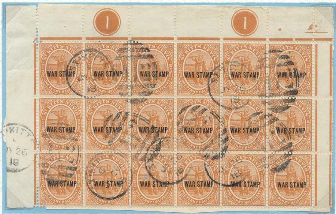
Plate 1 block of 18 from the left hand pane

This unusual block, used on piece, has a Duplex 112 cancel for 26th July 1918, which is earlier than the August issue date listed by Gibbons. The date is however that of the official notice issued by the Administrator's Office, and which stated that the stamps "are now on sale at the several Post Offices in the Presidency".