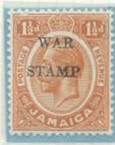
1 1/2d Orange stop inserted and "P" impressed a second time