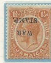
1 1/2d Orange overprint inverted