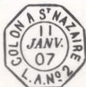
FIG. 1408/2. - retour -

This card would have sailed on the 'France' which left Colon on 4th Jan. 1901 and arrived at St. Nazaire on 23rd Jan. and Alenstein in Germany a couple of days later. A paquebot mark of 'Ligne A No. 2' - Salles type 1408 - was applied on 7th. Jan.