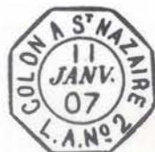
FIG. 1408/2. - retour -

This cover would have sailed on the 'France' which left Colon on 3rd Nov. 1900 and arrived at St. Nazaire on 24th Nov. and backstamped in Grenoble a couple of days later. A feint paquebot mark of 'Ligne A No. 2' - Salles type 1408 - was applied on 10th. Nov.