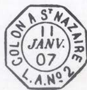
FIG. 1408/2. - retour -

Another cover that would have sailed on the 'Versailles' that left Colon on 3rd Dec. and arrived at St. Nazaire on 24th Dec. The receiving datestamp from Kentish Town shows that it arrived there on Boxing Day. A fine paquebot mark of 'Ligne A No. 1' - Hoskings type 1408 - was applied on 8th. Dec.