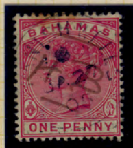
'H.B.' + Proud D.2 JA27/05 Reintroduced Q.V. 1 st