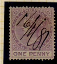
16/1/81 Magenta CC

These earlier cancels (1870-81 on CC stamps) show a light touch with a fine pen in a slow hand, speeding up with fluency on 16/1/81.