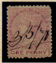
3/5/70 Rose: CC sideways p. 12½

The earliest village Ms. cancellation is that of '3/5/70' of Old Road below on the One Penny rose with sideways watermark; in all, for the four village P.O.'s, only seven examples are recorded by Michael Hamilton up to 5/75.