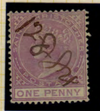
12-8-84 CA Magenta