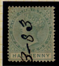
( )-3-83 CA