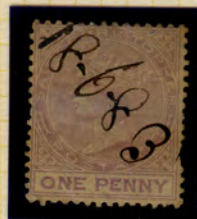
18-6-83 CA Magenta