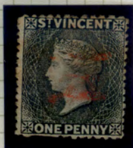
SG 22 ex Jaffe'