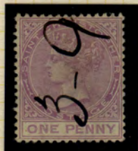
3-9( ) CA Magenta

Larger numerals, probably to cancel multiples.