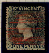
SG 18 ex Jaffe'

PML attributes the use of red crayon, concurrently with UE.1, to Union Estate on the basis of a cover dated 9.iv.1875