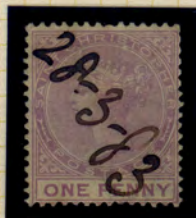
28-3-83 CA Magenta