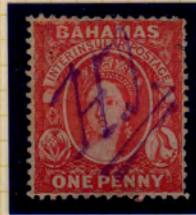
(CC ~ 1877 issue)