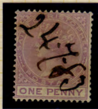
24-7-83 CA Magenta