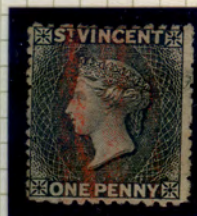
SG 22 ex Jaffe'