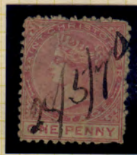
28/5/70 Rose: CC p. 12½