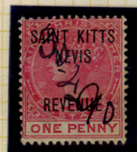
30-4-90 Pos. 24: distorted 'E' SG R3: rare on revenue