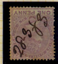
28-3-83 CA Magenta