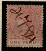
4-7-84 CA Carmine-rose