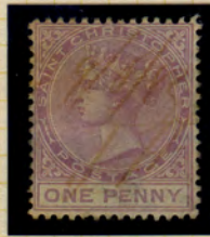
9/6/8? Magenta CA