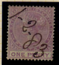
1-2-83 CA Magenta