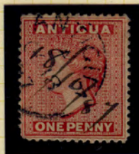
18/10/87 ANTIGUA CDS SAME DAY