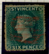
SG 16a ex Jaffe'