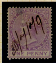
30/7/79 Magenta CC