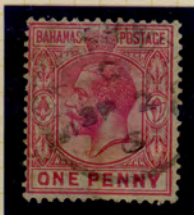
SP 2/(1)6 LKD †