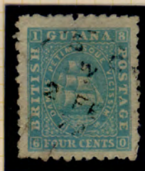
2 FE/72 * LKD

(ii) Manuscript Code W or W1: 26.v.76 ~ 18.vi.77