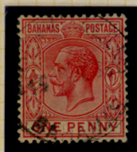
19 APR 36