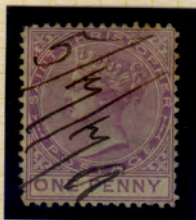
5/7/79 Magenta CC