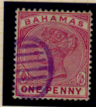
ex-Lydington* violet ink