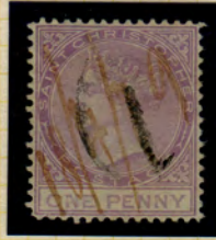
18/4/79 Magenta:CC Overstruck K3, state I (LKD)