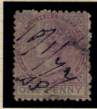
10/1/77/S.P. Magenta CC p. 12 1/2

The earliest recorded Ms. Sandy Point cancel is 31/5/75; it is the scarcest of the four village P.O.'s in the manuscript period.