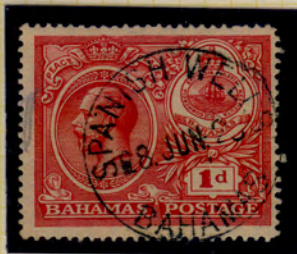
28 JUN 2?