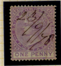
23/9/78 Magenta CC

One of two known 'SP' examples ex. Augusta; lot 176