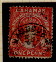
(CC ~ 1877 issue)