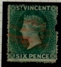
SG 19 ex Jaffe'