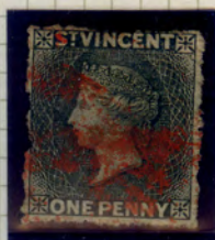
SG 18 ex Jaffe'