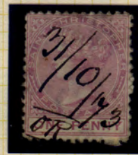
31/10/73/OR Magenta: CC p. 12½ Only known 'OR' example ex. Wynstria: lot 175