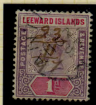
23/11/97 ANTIGUA CDS SAME DAY