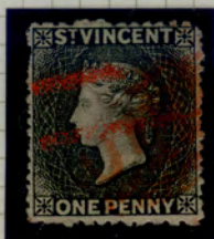
SG 22 Overstruck A10 (PML 4)