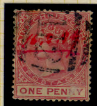
16/2/87 Overstuck A12