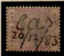
'cay(on) 20/12/83 on revenue.

Early strikes are small and neat, becoming progressively larger; date underlined by the mid-1880's. Five covers are known (three of them in this collection) 1896-98 from the Leewards period, all with Ms. cancellation positioned away from indicium or adhesives. According to Wynstra, only Cayon continued to cancel in Ms. after 1892, but other villages appear to continue the practice.