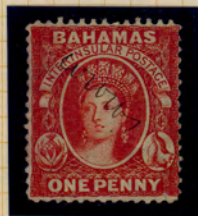
CC reversed 'ANDROS'