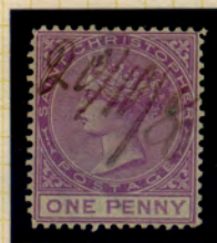
20/10/80 Magenta CC