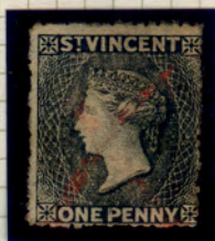
SG 18 ex Jaffe'