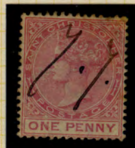
7-7.( ) CA Carmine-rose