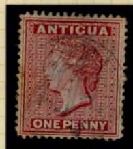
? + CDS