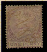
10-1-83 CA (cleaned)

These later cancels (1893-90 on CA stamps) show a heavier touch with a broader pen in a slow hand - probably the same writer as for the earlier examples - with dashes or dots in place of slashes.