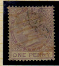
2/2/83 Magenta:CA Cleaned: o/struck Bogas post.