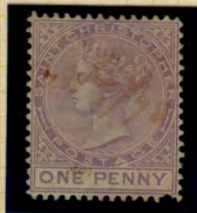
7/5/75 cc (cleaned)