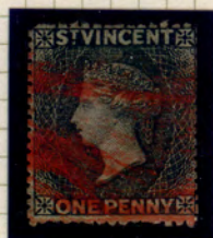
SG 18 ex Jaffe'