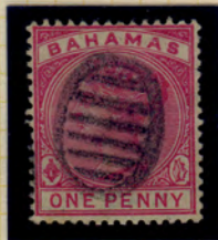
ex-Lydington* black ink