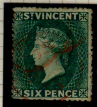
SG 19b ex Jaffe' Overstruck St. Vincent cds