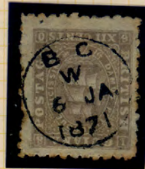
6 JA. / 1871