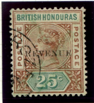
Corozal 12 MM