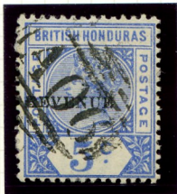
REVENUE Punta Gorda