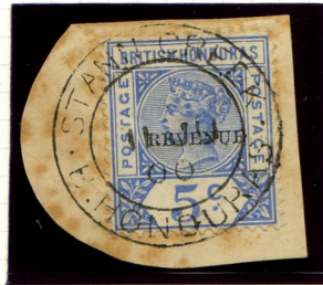
Stann Creek 11 MM