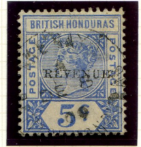
The Cayo 12 MM narrow 'U'