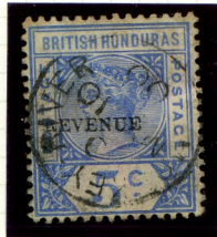
Monkey River 11 MM