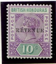
Tall narrow 'U'