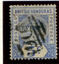
Orange Walk 12 MM