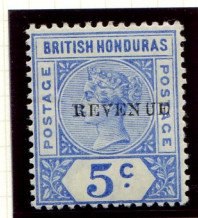
Tall narrow 'U'