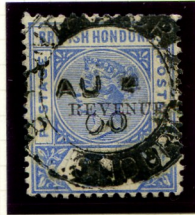
Punta Gorda 12 MM