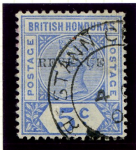
Stann Creek 12 MM