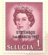
Block showing the constant "deformed L" flaw