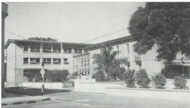
LEGISLATURE COUNCIL BUILDING