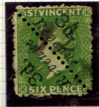
Variety: raised stop (right half) ex R. Lowe