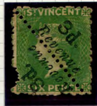
Variety: raised stop (right half)