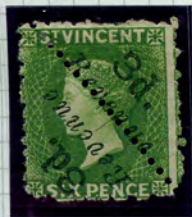
Original unsevered pair

There was no threepence postal duty at this time.