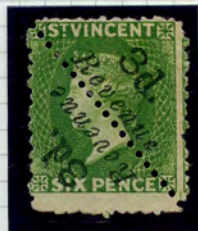
Original unsevered pair (SG 1984 L176)