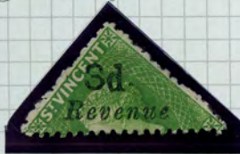
Unused Variety: raised stop (Rt. half)