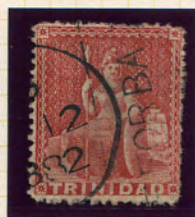
O.7. '23' ? 12/1882