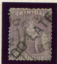
fig 8/art 2