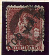
Type O.2. '4'

(i) (a) Type TL.1. 27x3.75 mm : oval 'O's : lypheu : overprint ? : black