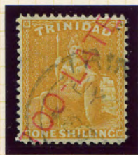
fig 3/art. 2