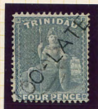
fig 4/art. 2

(i) (g) Type TL. A(b) : 28.5 x 4 mm : oval '0's : cancel/precancel : black : hyphen ~ Fig 6, type TL A in BWISC article, but measures differently from TL A above ('0's closer together : wider gap between '00' and 'LATE')