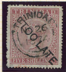
fig 6 / art. 2