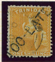
fig. 5 / art. 2