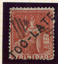
Type O.5. '4'