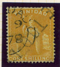
fig 9/art 2