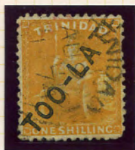
P.o.S. AU 9 1874 ex-Mariott