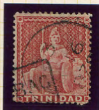
O.7. '23' MR 16/1878

~ Issued to Cedros Steamer and known used in conjunction with Type O.7. '23' cds 1872-82. Two covers known.