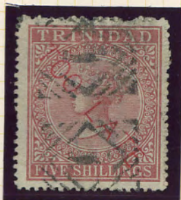
fig. 7/art 2.