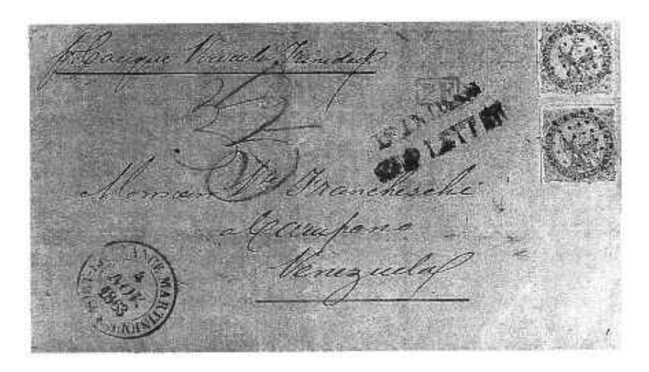
Fig.1 Trinidad Ship Letter cover sent from Martinique and forwarded to Venezuela

The use of the "TRINIDAD-SHIP LETTER" handstamp continued into the philatelic era. I would like here to present a cover I believe interesting for various reasons (fig. 1). Sent from St Pierre in Martinique on 3 November 1863, stamped at Fort de France on the 4th, it reached Trinidad on the 6th. It was then forwarded to Carupano in Venezuela, but the date of forwarding is not known, while the date of arrival must have been the 11th according to a written note on the inside. The cover bears the rare handstamp though the impression is barely legible, perhaps because of saltuary use and the lack of concern with which it was tended. It also bears blue and black pencil marks relating to local postage, difficult to interpret <sup>7</sup>, as is the small "PF" (Payé frontière) mark which is altogether unusual <sup>8</sup>. The same cover also has 10c. and 40c. stamps from the 'General' French colonial series, which seems to have been normal, typical of covers carried from the Antilles by English ships <sup>9</sup>. And if the letters points of dispatch and destination.